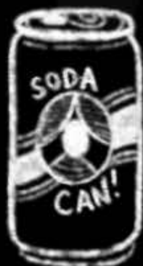
POP CAN OF YOUR CHOOSING